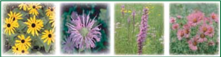
Black-eyed Susan Bee Balm Liatris New England Aster

DO NOT DISTURB! Minimize disturbance of existing submerged and emergent aquatic vegetation and try to keep cleared swimming areas as small as possible. Aquatic vegetation clarifies water, soaks up excess nutrients, helps stabilize the shoreline with its dense root systems and provides habitat for fish and other aquatic life.